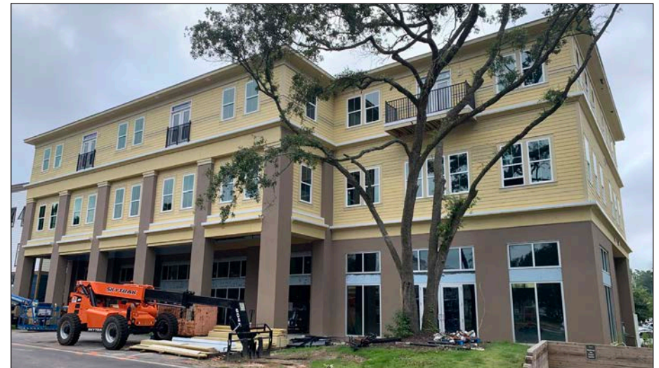
Bowen Market (Phase 2) completion set for late Summer 2022

*Bowen Village Retail Market Analysis, Gibbs Planning Group, December 28, 2021